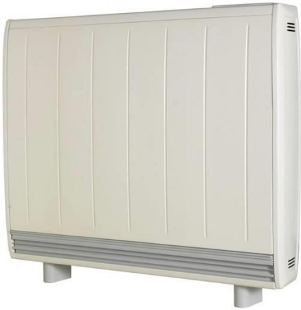
Quantum Electrical Storage Heater

Glen Dimplex Quantum Electrical Storage Heaters have been installed at the EnergyLab E-hub in Nordhavn and at DTU Risø and DTU Lyngby campus. The test will give an understanding of how to store electrical energy in low-cost periods.