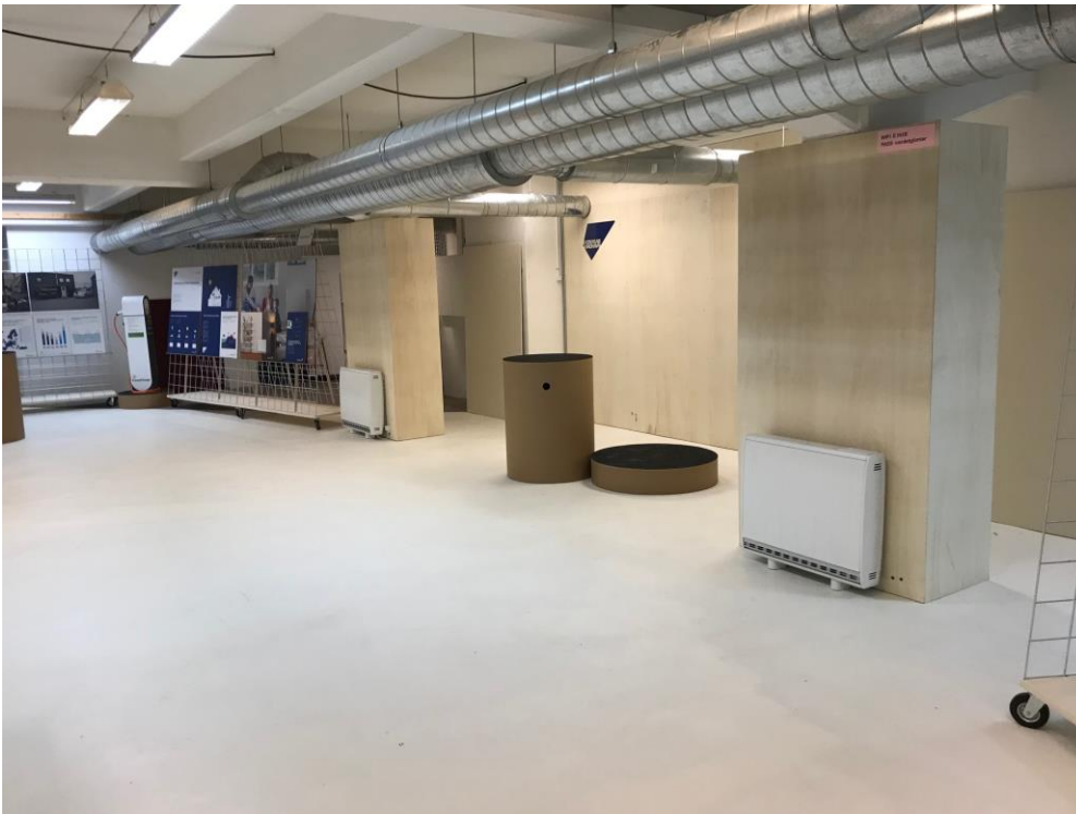
Quantum Heater installation in Showroom